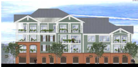
The Kugler and The Short Moss Landing Marina and Yacht Club Entrance