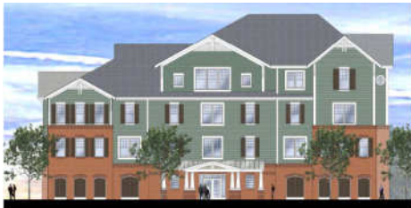
The Kugler and The Short Moss Way Entrance