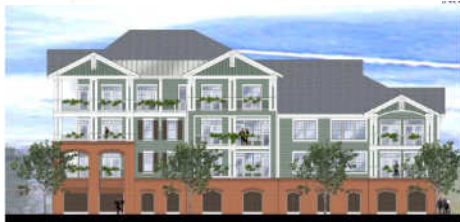
The Kugler and The Short

Moss Landing Marina and Yacht Club Entrance